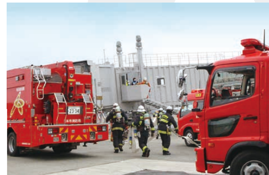
*Fire drill (March 2024)