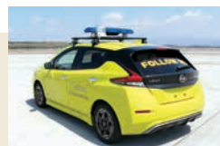
Electric vehicle used for runway inspections and other tasks

They showcase the latest agricultural technology system that combines hydroponics with artificial lighting. It enables stable, pesticide-free cultivation and also helps conserve water.