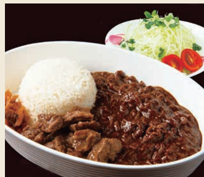
▲ Horse Tendon Curry (+ salad) ¥1,700 The deep flavor comes from a broth made with horse tendon (lunch only).

For a special meal—such as sending someone off or welcoming them—consider trying our Five-Cut Horse Sashimi Platter, which includes marbled cuts, loin, belly, tenderloin strip, and mane, for ¥2,300. As a long-established horse meat restaurant, we invite you to experience the unique flavors we have proudly served for many years.